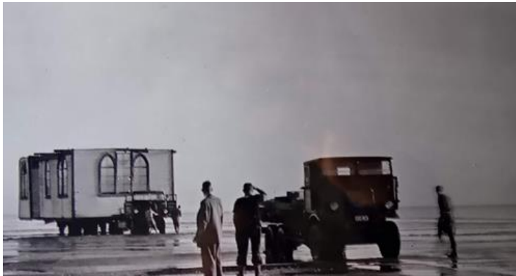
"The tide is coming in. Will we make it?"

On 26 November we celebrated the laying of the foundation stone of our church building on 24 November 1911. We gave thanks for those who built the church at Te Horo, those who worshipped there, those whose vision brought the building to Waikanae, and for all who have been a part of this church's life and mission in Waikanae. We remember our building's journey to its home on the hill when it travelled along the beach on the back of a truck.