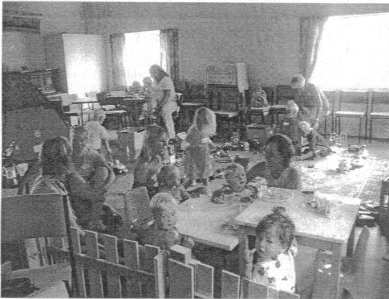
Waikanae Café Playgroup

Pictured above ~ some of the happy Mums, Dads and children at the second Café Playgroup held in the Church Lounge.