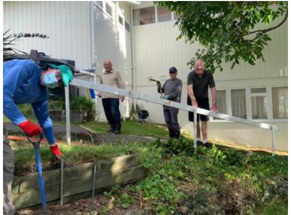
Working bee helpers in March clearing the gardens and washing the Raumati buildings.

We have been pricing new curtains for both meeting rooms, and are shocked at how much more expensive they are. We are also budgeting to replace the very old vertical blinds behind the piano and organ.