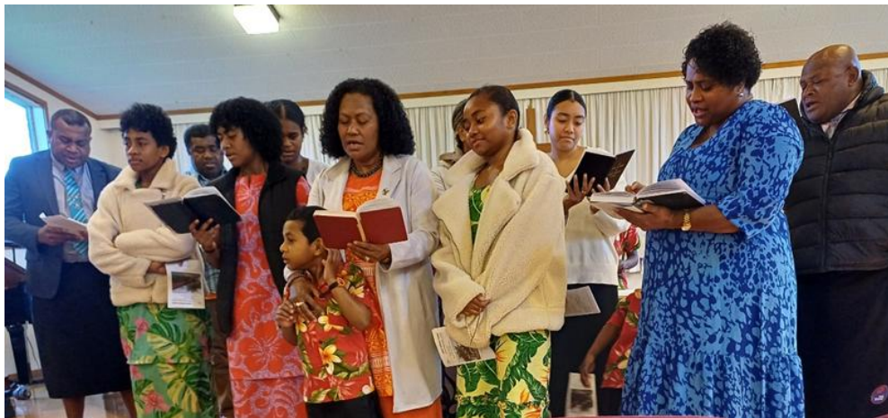
The singers of the Kapiti Fijian Congregation