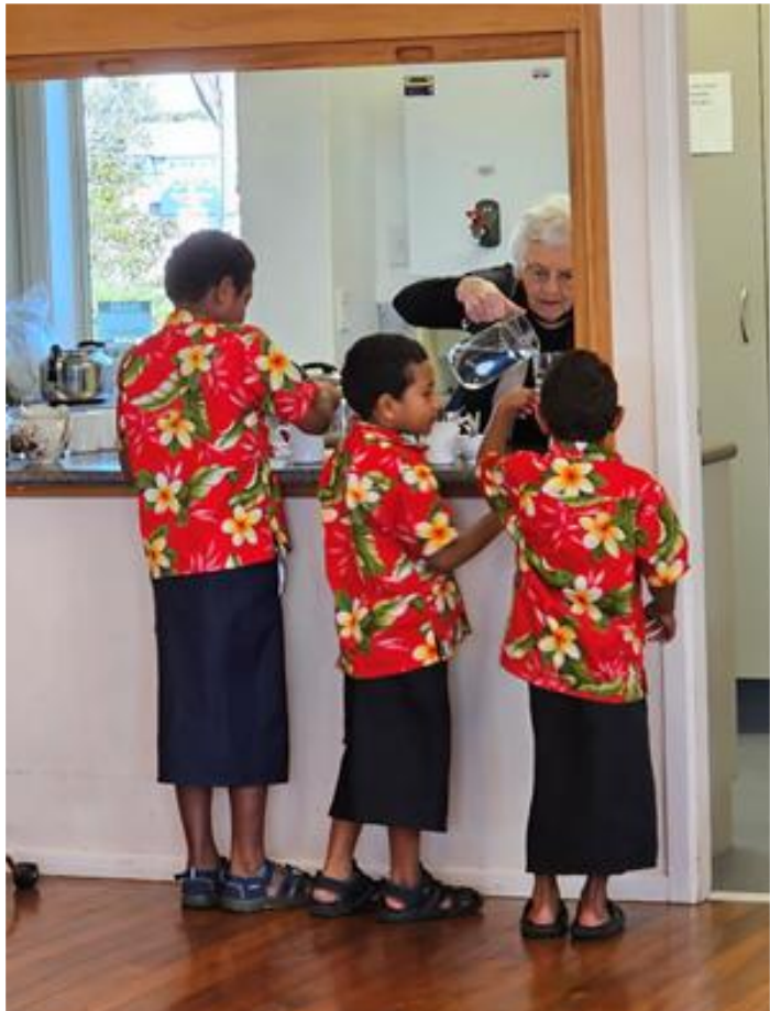
Young members of the Kapiti Fijian Congregation at the shared lunch following the Parish Anniversary Service