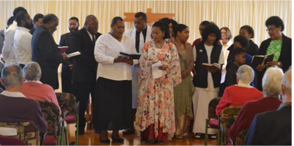
The members of our Fijian congregation were introduced at our first Service together and sang a beautiful hymn in Fijian