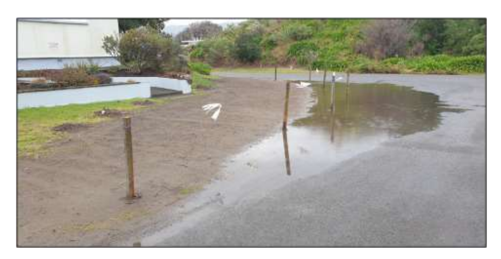
"Lake Taiata" otherwise known as the Waikanae Church front yard.

As to property and maintenance, Desmond Corrigan has been working on the church front yard, which Marie Smith told us had been flooding in every rain storm for decades. Fill from the neighbour's recent pool installation has been used to raise the ground level at the corner where flooding is the worst. Desmond has also sown the grass seed, which is already sprouting. Desmond visited KCDC, which has confirmed that there are no storm water drains near the church or in any nearby streets, so it is likely that we will have to live with some water pooling on the corner.